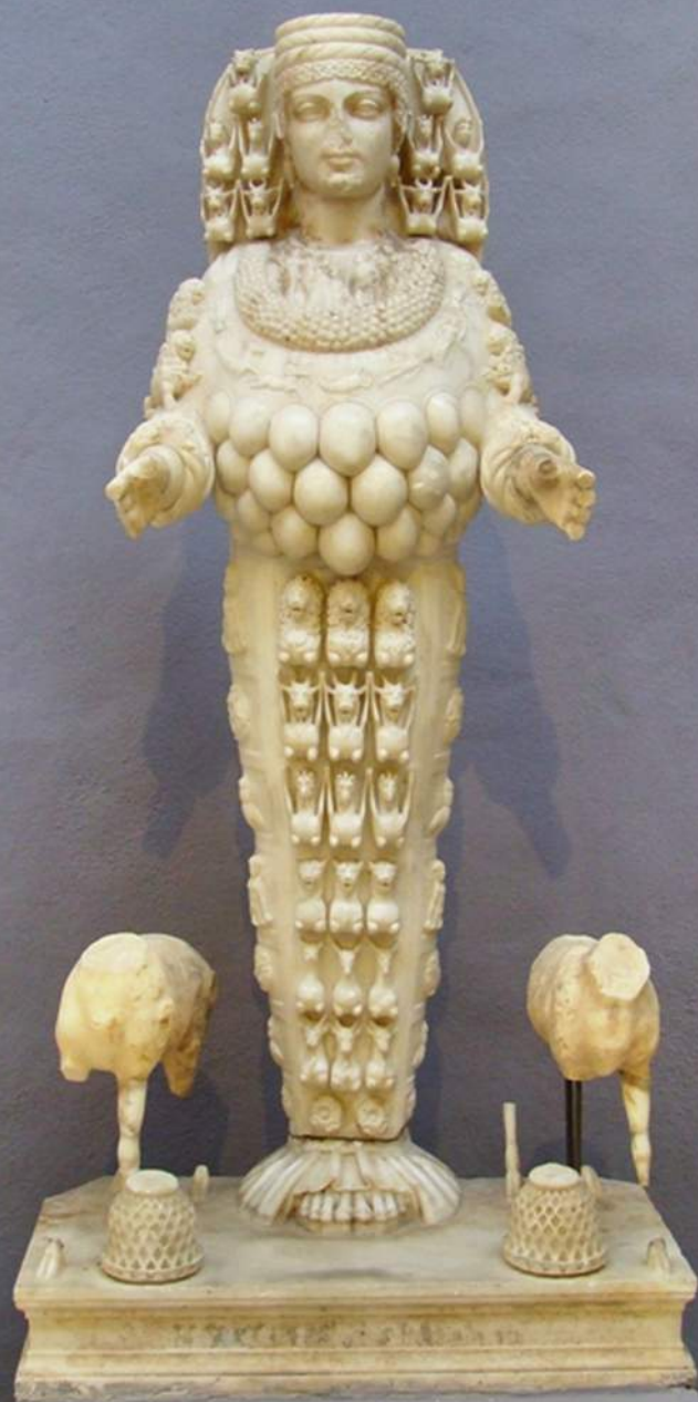
EPHES ARTEMIS M.S. 125-175 ARTEMIS EPHESSA 125-175 A.D. EPHESSIAN ARTEMIS 125-175 A.D.