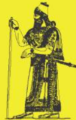
The Assyrian king (3:6)