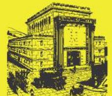
The Temple (2:4,7)

Directions Search nearby Save to... move▼